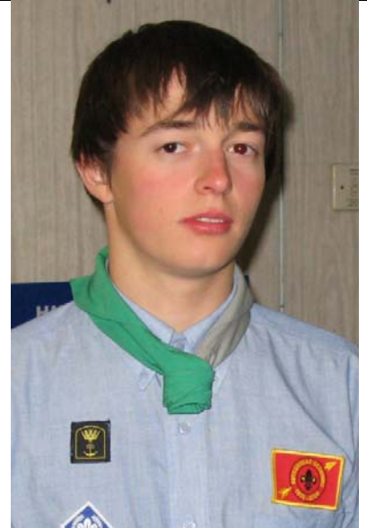
7. Quickly tied by the wearer