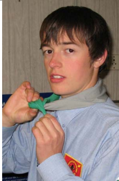
6. Tuck the end in